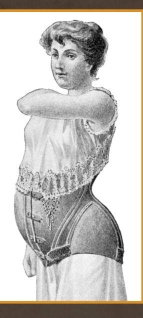
A pregnant woman wearing a corset

Soon-to-be moms were often expected to entertain guests with food and drink, typically handmade, which were referred to as "groaning cakes" and "groaning beer" in the 18th century. It was routine for birthing mothers and their midwives to drink the groaning beer during labor.