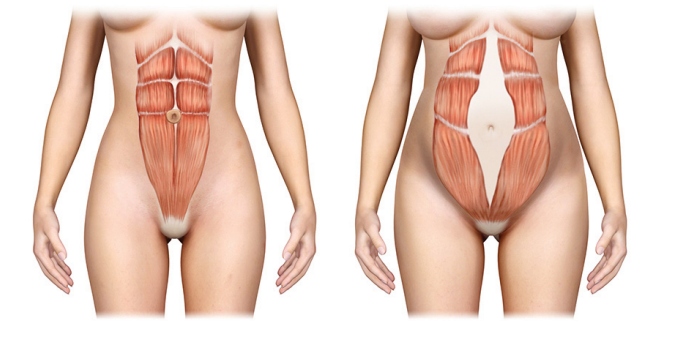
Abdominal separation during pregnancy

Abdominal separation is an unpleasant occurrence many women experience. This condition, known as diastasis recti, occurs when the abdominal muscles widen to accommodate the growing baby. It varies in severity, with some women noticing improvement after childbirth and with toning exercises and others requiring surgical intervention to repair the separation.